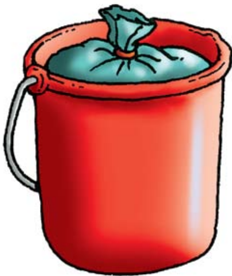
Tie the bag securely once it is filled with water