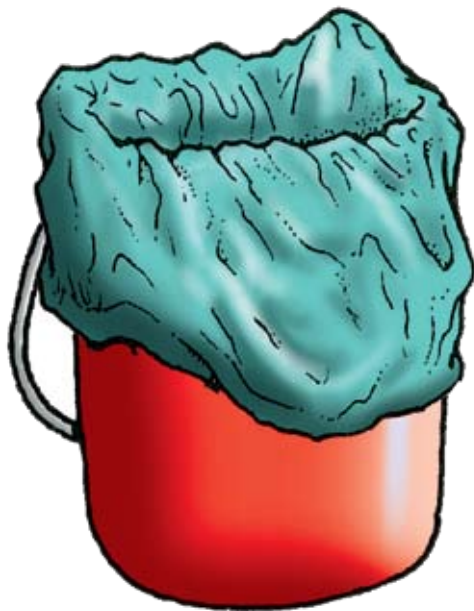
Line the bucket with a trash bag