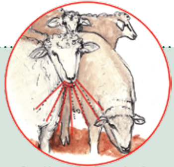
Coughing sheep transmits virus